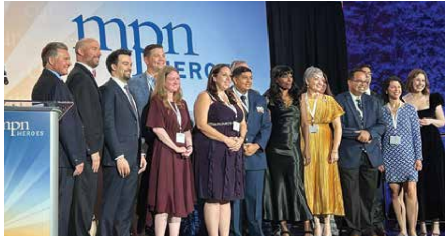
Individuals honored at the 2022 MPN Heroes