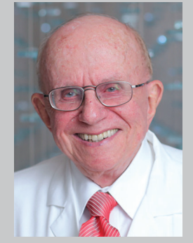
New Study Supports Interferon Treatment for Early Myelofibrosis

Hatch-Waxman sped up the approval process for generic drugs by allowing manufacturers to file an Abbreviated New Drug Application (ANDA) with the Food and Drug Administration. Since the FDA has already approved the Continued on page 2