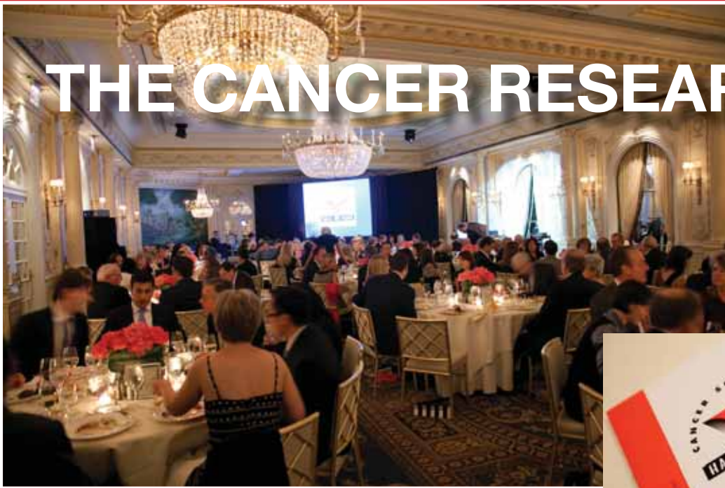
Hall of Fame guests